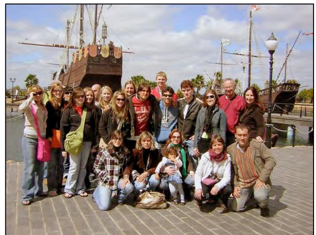
Tracy HS students and host families gather to visit the replicas of Christopher Columbus' ships in Huelva, Spain.

Sprichst du die Sprache; kennst du die Leute und die Kultur!